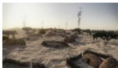
A hypothetical computer reconstruction of Marawah 8,000 years ago.